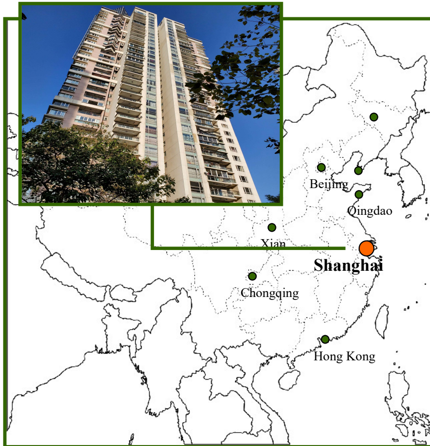
Shanghai Representative Office (China)